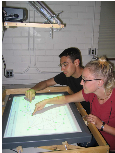
Fig. 1. Physical setup.

DiamondTouch table: The DiamondTouch hardware used in this study has a surface with a 79cm diagonal and a 4:3 aspect ratio. The table is connected through a USB cable to a Dell Pentium 4 desktop PC running Windows XP. All images, which normally appear on the display monitor, are routed to a video projector that projects them onto the table surface with the aid of a mirror; see Fig. 1.